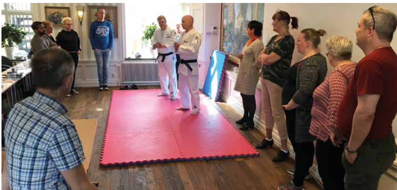
Picture: two instructors from a local judo club meet with representatives of county councils in the south of Sweden.

The most common work injury in all sectors is something as trivial as a falling accident. The employees trip, slip and tumble, and more often than you think this causes severe consequences. This has led into a three-year-collaboration between AFA Försäkring and the Swedish Judo Federation. Sponsored by AFA Försäkring, some 190 instructors all over Sweden teach groups off staff techniques on how to fall without causing yourself an injury, as well as methods of improving your balance and strength. This collaboration has gained quite a bit of interest so far, and it is scheduled to