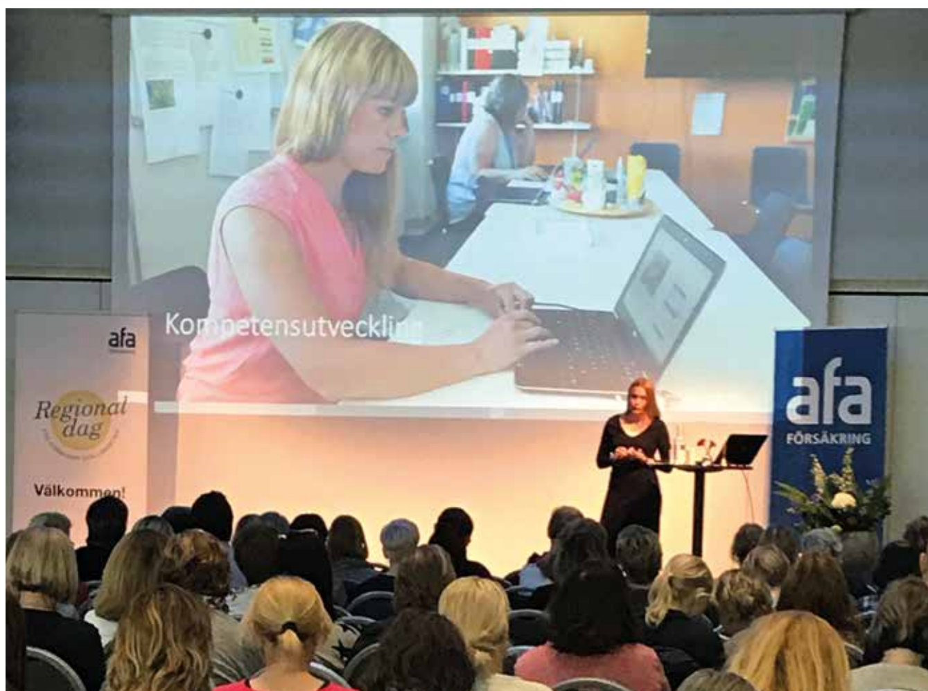
Picture: A lecturer is talking about RTW to some 200 people in Gothenburg.

Per Winberg AFA Försäkring www.afaforssakring.se pictures: © Per Winberg