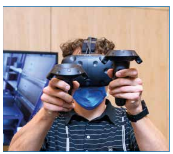
Virtual Reality ermöglicht das Eintauchen in virtuelle Arbeitswelten, © Gregor Nesvadba

These data can be used for software-supported evaluations of whether and how the forklift operator is distracted during his work, whether he can perceive all dangerous situations and how he or she reacts in different situations. This forms the basis for the analysis of actual situations and for the development of measures that contribute to the improvement of safety in intra-company transport.