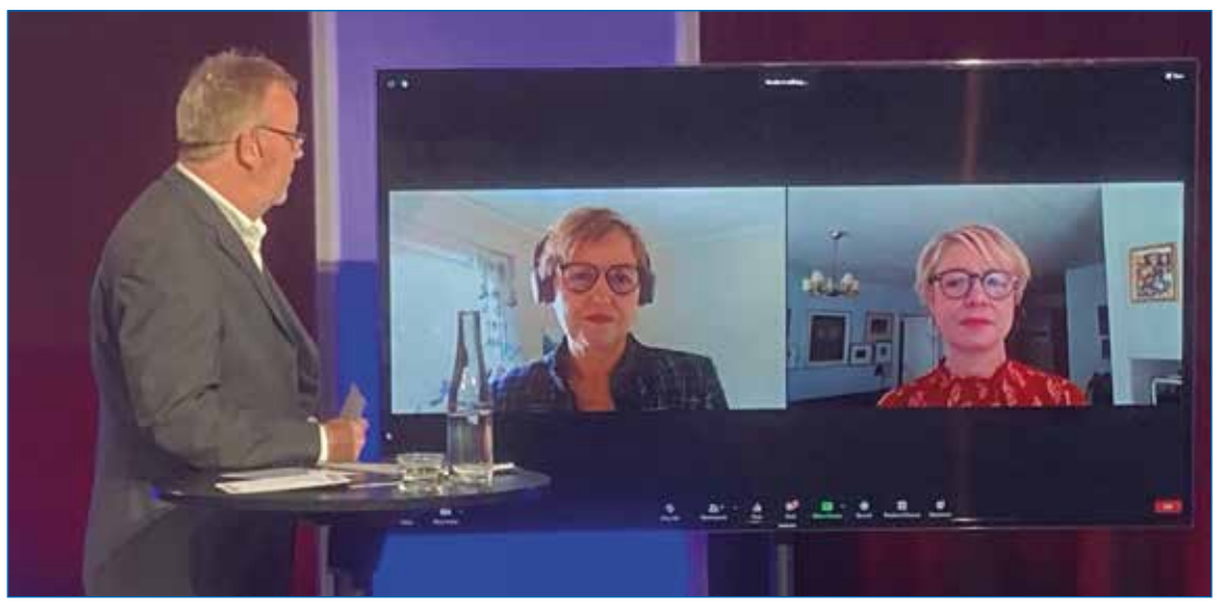
A seminar via web to some 500 participants, and 2 of the lecturers via link!

Shortly after the article for the previous Forum News was written, the government changed the legislation so that COVID-19 is now included in the list of infectious diseases that can be recognized as an occupational disease. But the same list also states that in order for the infection to be recognized as an occupational injury, the person must have contracted the infection: "during work at a health care facility, or in other work in the treatment or care of an infectious person, or in the handling of infectious animals or materials."