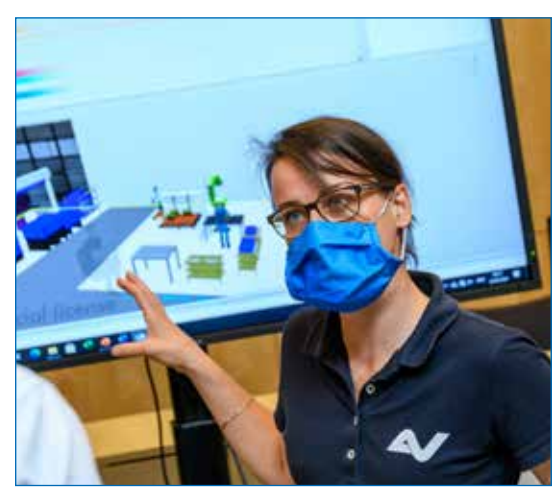
In the AUVA prevention department, digital prevention has long been a reality.

The aim of the developments with regard to quality in work is to ensure that no longer man has to adapt to technology, but that it is the technology that is increasingly oriented towards people: Sensors on the operator's body (wearable sensors) record various parameters and can, for example, detect stress. With the help of cloud solutions, machine learning and visual analytics, it should be possible to process and evaluate the data in such a way that, for example, as the immediate consequence is that the robot adapts its "working speed", thus reducing the stress level of its collaborating human counterpart.