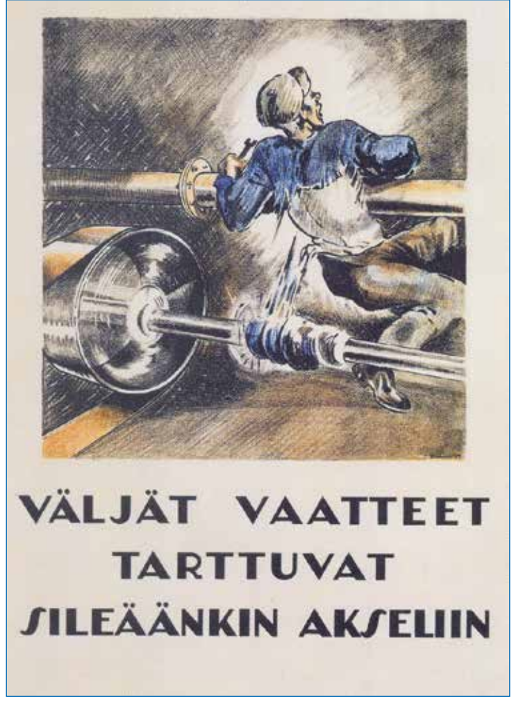
Loose clothing sticks to even a smooth shaft @ TVK

"By compiling statistics on occupational accidents and diseases and investigating the risks associated with occupational accidents and diseases, we contribute to the safety of Finnish work," Reini describes.