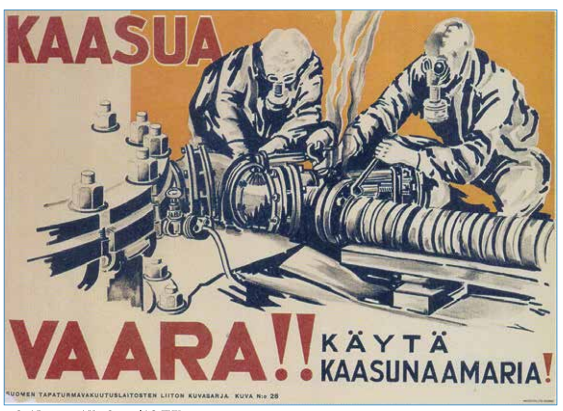
Gas! Dangerous! Use Gasmask!

Sanna Sinkkilä Finnish Workers´ Compensation Center (TVK) www.tvk.fi